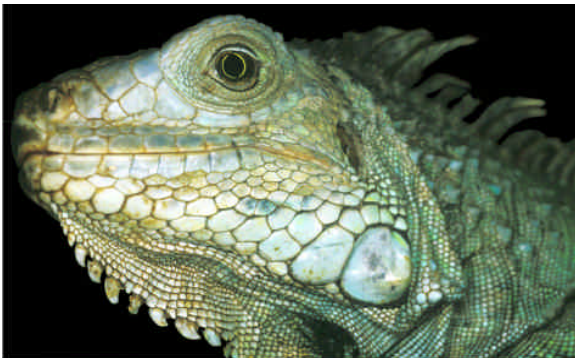
Green Iguana – Vacation guest

The recently founded conservation society ARCO (Amphibian and Reptile Conservation) is concerned with amphibian and reptile conservation and to collaborate with ARCO-Nepal reg. Soc., with Munich's and other universities, zoos and breeding partners. We accept, as far as possible, surplus stock of specimens with origin from mediterranean climate types like North-America, S-Europe, North- and South-Africa. or from any desert provenance of the world. Advice in maintenance and serious husbandry projects for keeping amphibians and reptiles in captivity is given to all members on request. Construction and maintenance of natural ponds or suitable habitat structures can be planned and realized.