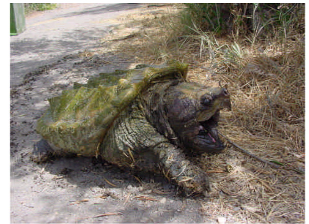
Alligator turtle – Macroclémys temminckii

Ponds, semi-natural terrestrial enclosures need proper and correct treatment and maintenance, food supply and others to find the animals in favorable condition. An annual membership is cheap but a necessary contribution to the work of ARCO.