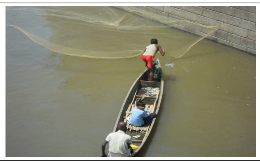
10. April 24 (Baisakh 12) Tuesday:

NP Wildlife Observation, Chitwan Museum and drive to Kasarah HQ cum Crocodile and Turtle Conservation Centre 15h departure for Kathmandu