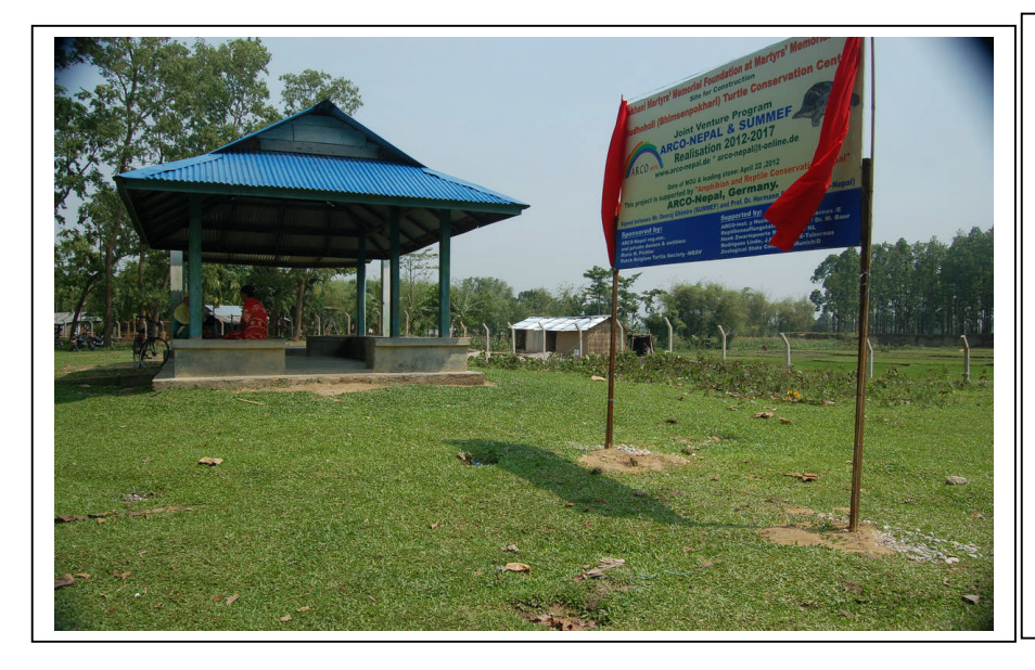
Former picnic place for TRCC Info+Education centre