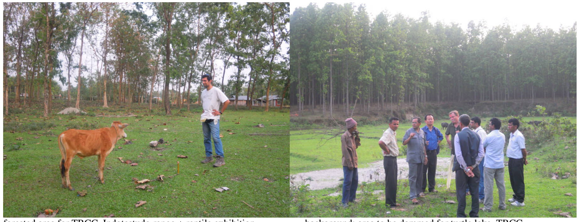
forested area for TRCC, Indotestudo range + reptile exhibition