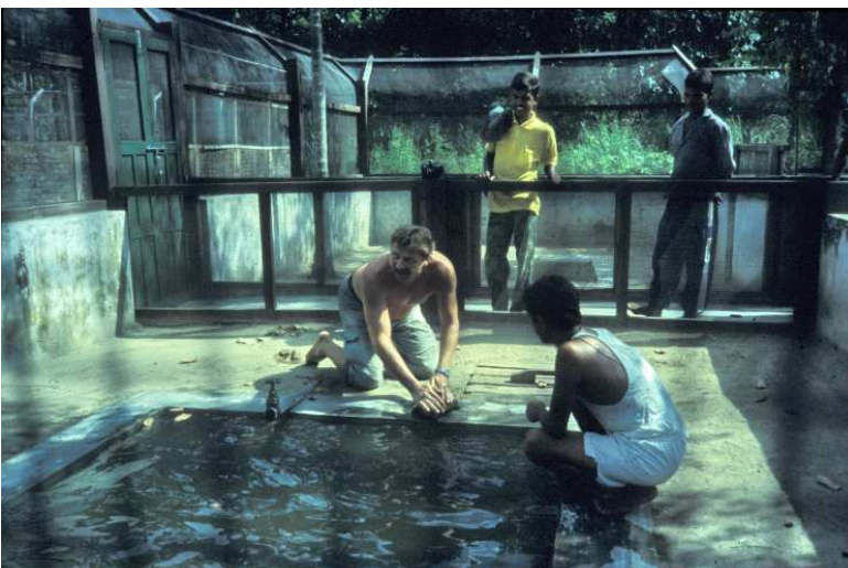
One of the hatchlings' and rearing ponds at Kasarah/C N P

The existing rearing and breeding area at Chitwan National Park turned out to be useful for that purpose and we try to take over that idea by constructing 6 small ponds of 100 x 150 cm and four of 200 x 200 cm. A general depth of 60 cm shall allow proper catching and handling of specimens and of course an individually controllable in- and outflow for proper and easy filling with fresh water and emptying for cleaning and disinfection are the basic conditions. The whole area must be fenced with strong chicken mesh wire against predators being dug into the ground till 30 cm and also the roof and lateral sides have to receive the same protection and natural grasses for giving shade partially. Each pool must be fenced individually and have a simple but proper door together with a small pathway or service corridor appropriate for reaching both sides of the tanks. We do have the idea, concept and the place – but clearly spoken – we need also some help from your side – with some donations to make this rearing and breeding area a reality!!!!!!!